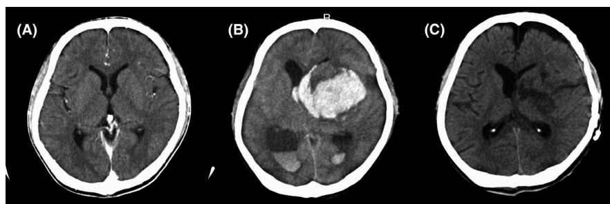
FIGURE 1 Temporal head CT images are shown. A CT image on admission (A) showed no remarkable finding. When the patient presented with consciousness disturbance, a CT image (B) showed a massive hematoma extending to the ventricle from the left putamen. A CT image after the removal of hematoma (C) showed that hematoma was effectively evacuated without recurrent hemorrhage

We present a notable case of a patient after the Fontan operation who present with a catastrophic intracranial hemorrhage, diagnosed as EGPA. Recent advances in surgical and clinical managements allow children with complex congenital heart