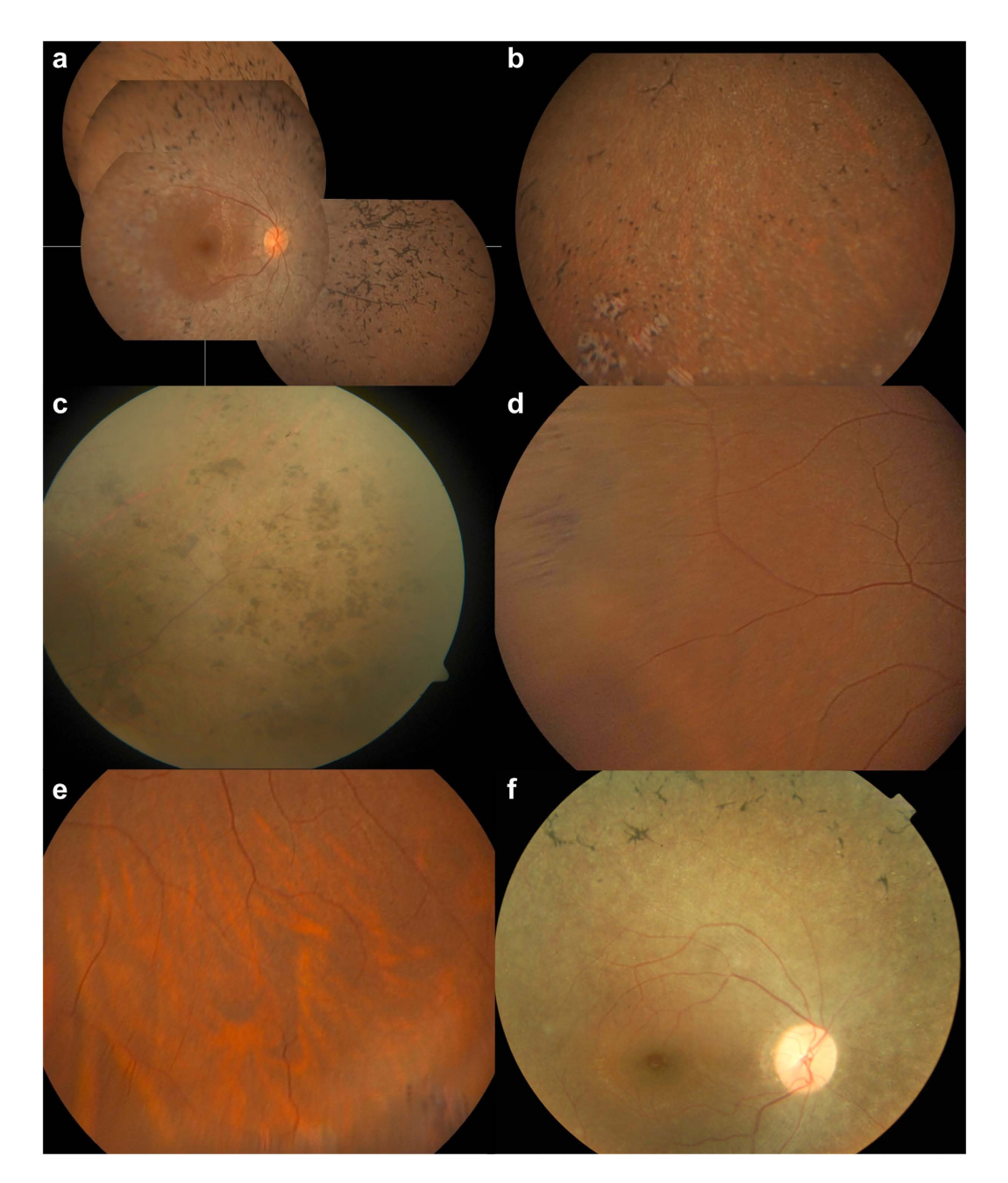
Figure 2. Fundus appearances. (a,b) Right eye of affected sibling IV:8, fundus montage images (a), periphery (b). Typical aspect of RP: retinal atrophy with vascular attenuation and relatively preserved macula. Note variation in morphology of pigment deposits: aspect of classic spicular pigmentary changes alternate with unusual nummular types and several well-delineated areas of punched-out retinal atrophy, as seen here in inferior periphery. (c) Fundus of left eye of affected sibling IV:5, periphery. Note conglomerates of grouped nummular intraretinal pigmentations in superotemporal periphery in IV:5. (d,e). Fundus of right eye of sibling IV:6 with mild subclinical expression of disease, periphery. Multiple zones of peripheral intraretinal pigment migration as mild expression of RP; note difference in aspect of lesions with both spicular and nummular pigmentations combined. (f) Fundus of the index patient of Pakistani family RP21<sup>8</sup>. Classic aspect of outer retinal atrophy with spicular intraretinal pigmentation without the unusual and distinct grouped nummular pigmentation seen in the family studied here.

In parallel, sequencing of all coding and non-coding exons of SAMD7 did not reveal any pathogenic changes. However, subsequent analysis of regulatory regions of SAMD7 in one affected sibling revealed four different variations located in CBRs. Segregation analysis demonstrated that the affected siblings IV:5 and IV:8 are homozygous for these variants, while all other investigated family members are heterozygous carriers (Fig. 1a). SAMD7 has two previously functionally validated CBRs, one located in the promoter region, CBR1, and the other, CBR2, located in the intronic region between the first two non-coding exons of the gene<sup>17,19</sup>. The homozygous variants are known single nucleotide polymorphisms (SNPs), having a minor allele frequency of 1.6% according to dbSNP