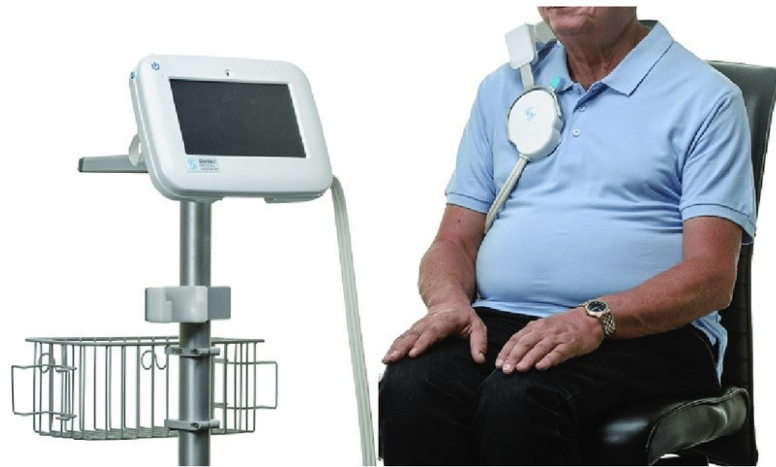
Figure 1. A ReDS system, which consists of a monitor and a sensor unit.

pressure, measured by right heart catheterization and lung fluid amounts, calculated by high-resolution computed tomography in patients with chronic heart failure [7,8].