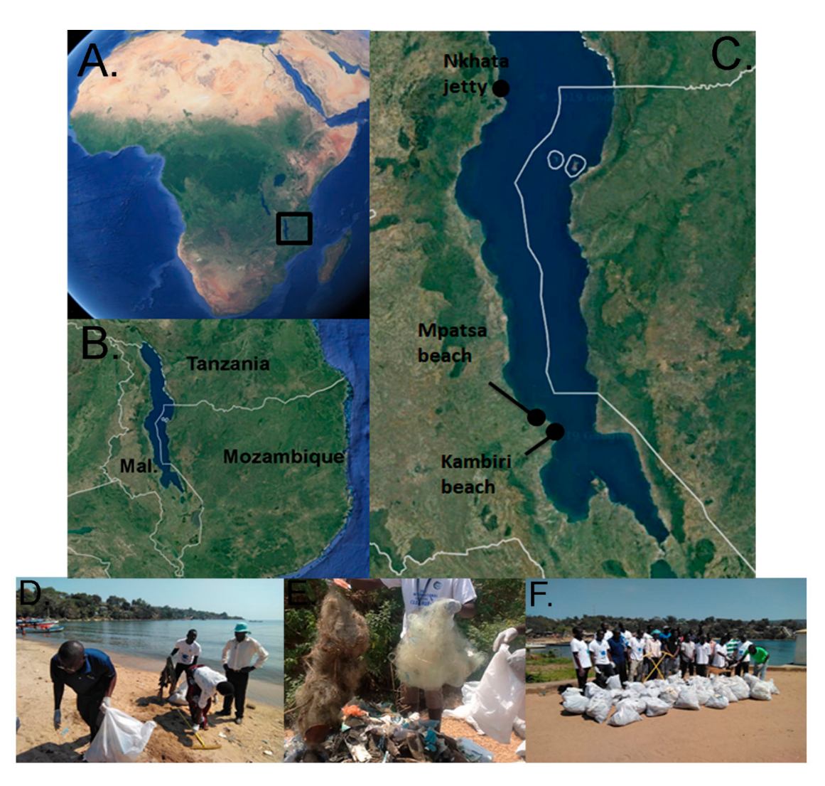
Figure 1. Location of the three beach clean-up sites on the Malawian coast of Lake Malawi ( A – C , Mal. = Malawi). Images D – F show the volunteers during the clean-up and typical examples of the debris collected during the clean-up at Nkhata jetty in 2018.