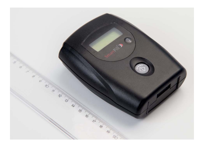
Figure 3 Data receiver with 'event button'.

Owing to the German legislation concerning medical devices, the PIDuSA trial will be audited by the district government at least for one time. The government reserves the right for further auditions depending on the occurrence of serious adverse event (SAE) or serious adverse device effects (SADEs).