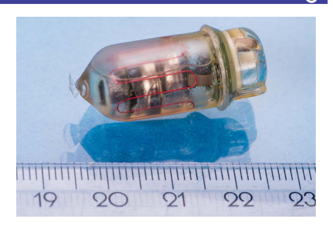
Figure 1 SmartPill<sup>®</sup>.

Technical progress within the past decades led to the development of electronic capsules applicable for visualisation or physical and chemical monitoring of the complete GI tract. By measurement of intraluminal pH value, temperature and pressure, the so-called SmartPill<sup>®</sup> (figure 1) is able to indicate gastric emptying time (figure 2A, B, sudden pH increase), small bowel