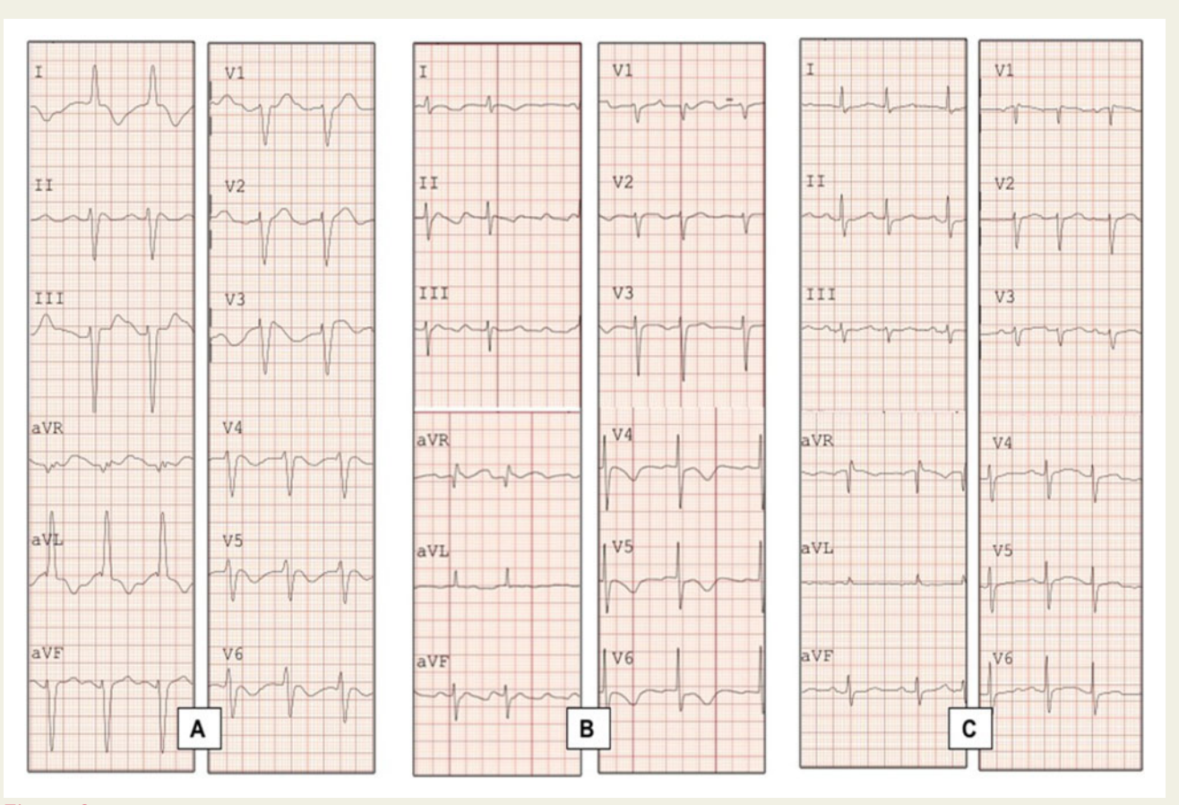
Figure 3. Twelve-lead electrocardiogram showing electrocardiographic evolution. (A) Twelve-lead electrocardiogram showing an atypical atrial flutter with wide complex QRS appearing immediately after synchronized cardioversion. (B) A repeated 12-lead electrocardiogram showing persistence of atypical atrial flutter now with narrow QRS complex. (C) A pre-discharge 12 electrocardiogram showing resolution of the electrocardiogram abnormalities, with a sinus rhythm and atrial extrasystoles.