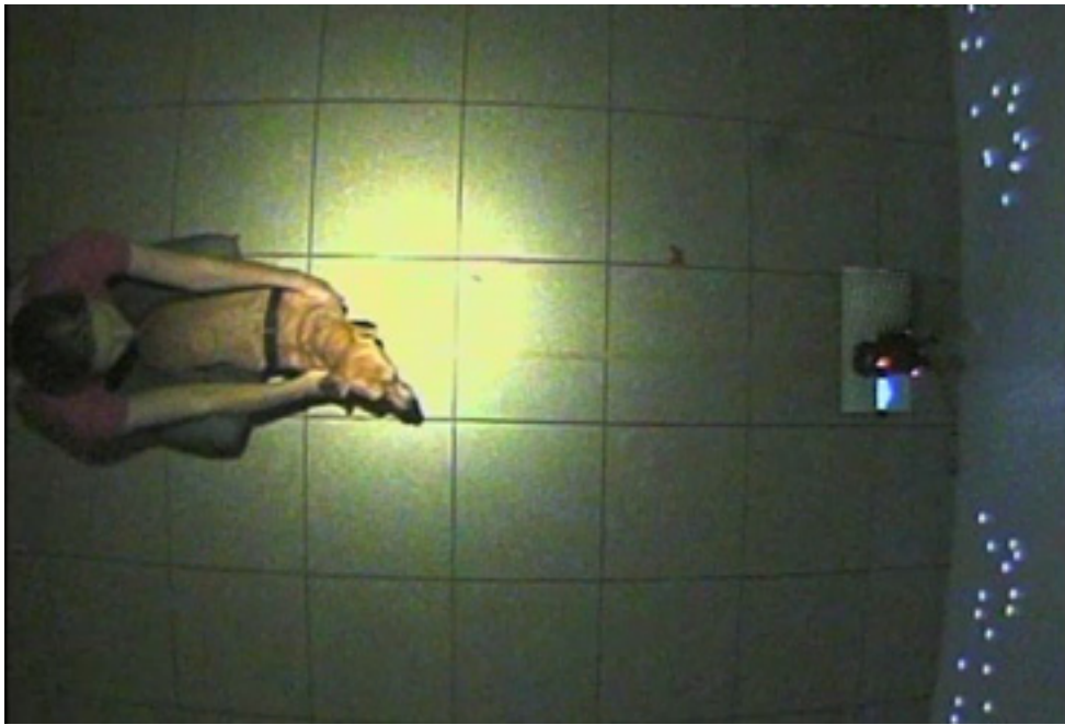
Figure 2. A video-still of the experimental setting, during a presentation.