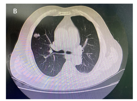
FIGURE 1 | (A, B) Computed tomography of chest revealed a space-occupying lesion in the upper lobe of the right lung.