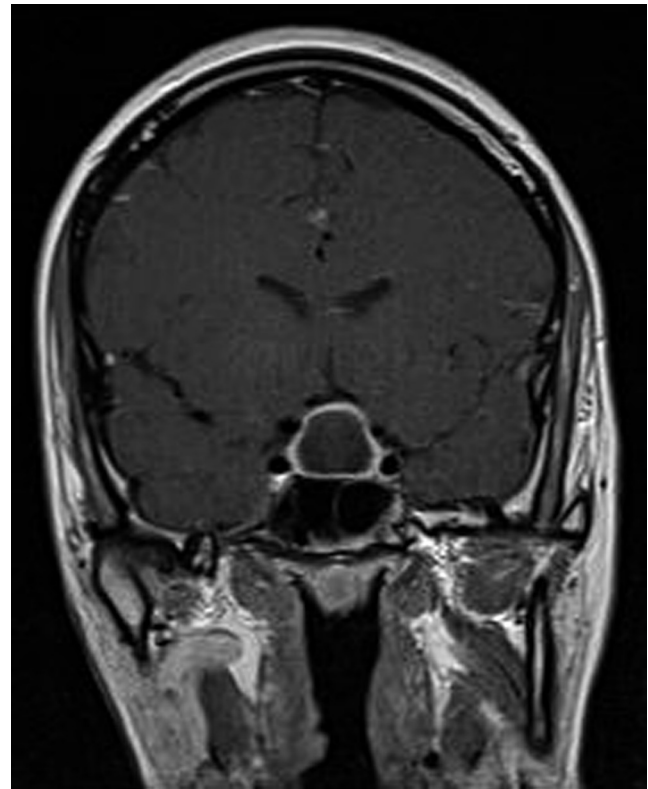
Figure 1 Preoperative T1-weighted coronal, magnetic resonance imaging after intravenous gadolinium contrast administration showing a suprasellar peripherally enhancing, cystic mass measuring 19 × 15 × 22 mm with superior displacement of the optic chiasm.

Signs or symptoms of adrenal insufficiency or hypothyroidism were not present, so glucocorticoids and levothyroxine were not initiated. Due to her compressive symptoms and pituitary hormone deficiencies, transsphenoidal resection was recommended