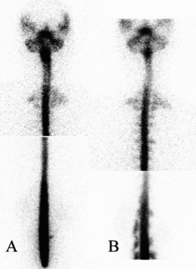
Figure 3. A 36-year-old woman underwent radionuclide cisternography to identify the site of CSF leakage

Left column: On 6-hour post-injection image, RNC showed areas of tracer accumulation along both sides of the paraspinal areas at the upper thoracic level and the right side of the lumbar level. Right column: Immediately after the 6-hour supine imaging, the posterior views obtained in the sitting position showed additional sites of CSF leakage at both sides of the paraspinal areas at the thoracic and lumbar levels, especially at the lumbar spine.