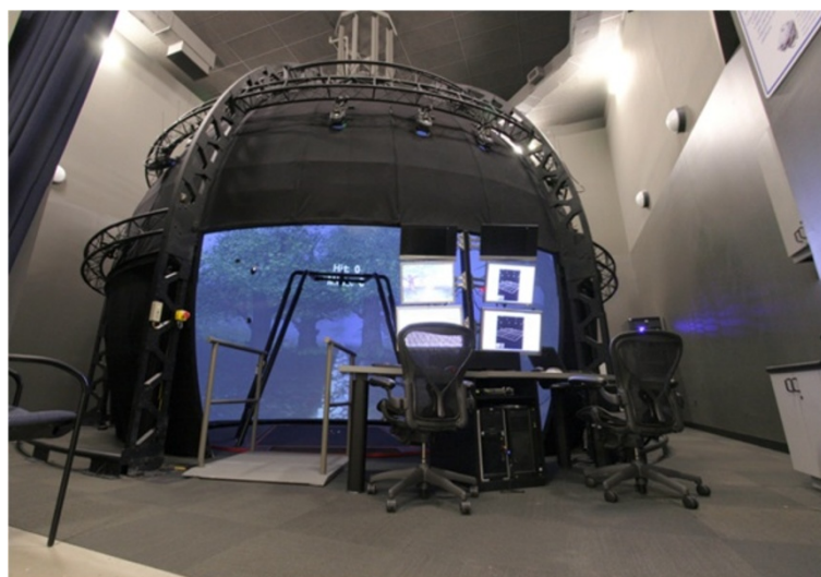
Figure 3 CAREN in a dome configuration.

Hawkins et al. [14] studied the relationship between performance and difficulty by altering game velocity and surface perturbations in a virtual game environment. Performance deteriorates as game difficulty increases, when