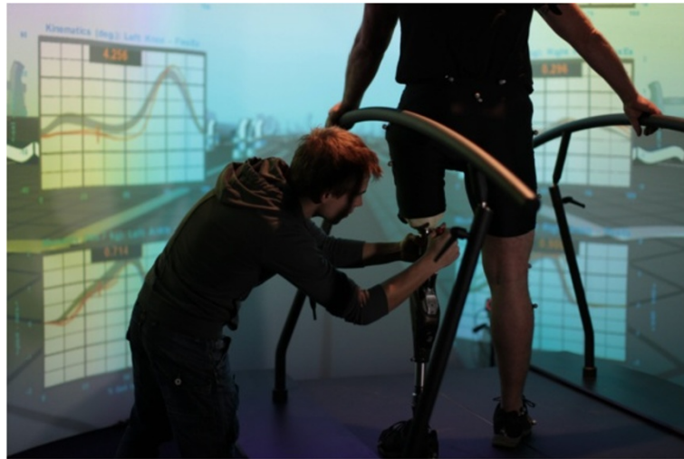
Figure 6 GRAIL, a treadmill, combined with a screen on which a scenario is projected and performance of the patient is required.

results. The presence was highly appreciated. They plead for further research with more patients to be performed to obtain more reliable results.