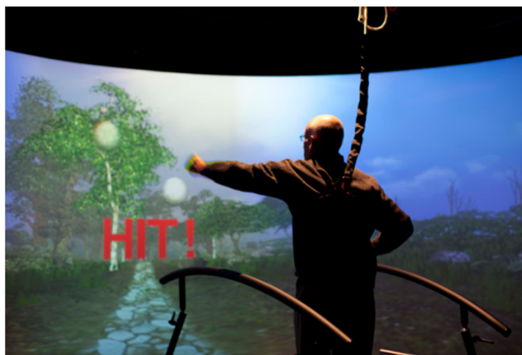
Figure 4 Dual tasking which means the subject on the CAREN is offered a scenario to walk through and at the same time performs certain other tasks like catching balls.

The Netherlands Armed Forces have a Military Rehabilitation Center, where all military rehabilitation patients are being treated. Almost 40% of the population is civilian patients. In Table 1, you see the distribution of the patient categories. As expected, the great majority of stroke patients (90%) were civilians, whereas 80% of the amputation patients were military.