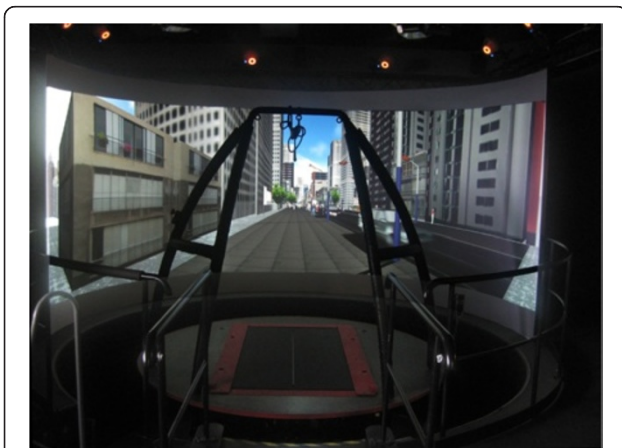
Figure 1 CAREN platform with a 180° screen.

Barton et al. [12] states that the functionality of the usual movable platforms used in human balance studies is limited, as the rotations are allowed around a pre-defined axes, which typically runs close to the platform's surface and therefore cannot be used to directly investigate control