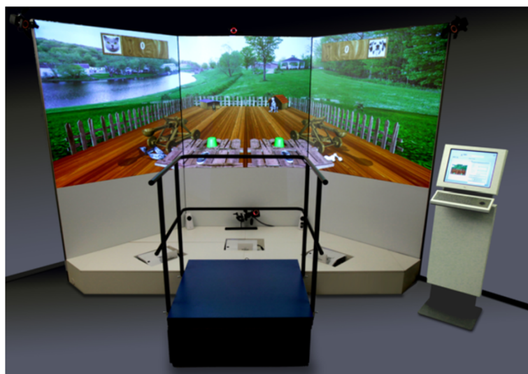
Figure 7 STABLE, a platform with diagnostic facilities and training programmes, mainly focused at stability training.

platform, GRAIL uses a dual belt treadmill. GRAIL needs less space and provides quick output of results. It offers a total package solution for clinical gait analysis and gait training using the latest technologies. Besides the functionality of a traditional gait lab, GRAIL provides real-time gait analysis, gait off-line analysis tool (GOAT: a gait report directly after the session that facilitates video analysis and post-processing/filtering options for data analysis). Recording multiple steps makes it possible to calculate averages, standard deviations and variations of gait parameters over time, functional gait analysis for the identification of pathologic responses to perturbations, visual challenges, fast pitch, and sway and belt speed changes, enable identification and quantification