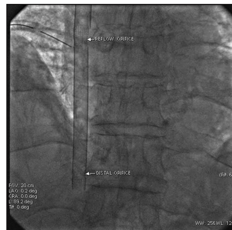
Figure 1: Fluoroscopy for Avalon positioning

VV ECMO is indicated in patients with severe respiratory failure that is refractory to optimal mechanical ventilation and medical therapy. ECMO may be used as a bridge to recovery, [4] lung transplantation, [5] or decision therapy in select patients with severe and often refractory respiratory failure. Following the results of CESAR trial [6] and the