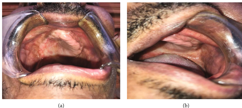
FIGURE 3: After twelve months, the clinical regression of oral histoplasmosis lesions.

characteristics of H. capsulatum . In addition, the immunohistochemical reactivity to Histoplasma using polyclonal antibody was positive; for polyclonal P. brasiliensis , Leishmania spp. and Calmette-Guérin bacillus were negative. The diagnosis of oral histoplasmosis was established. We did not search for fungi in other biological samples.