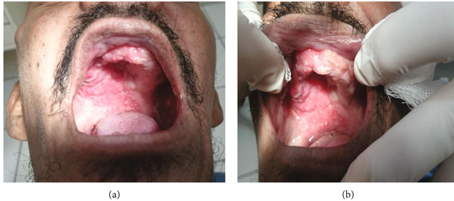
FIGURE 1: Clinical aspect of intraoral lesions in the palate and alveolar ridge regions (a, b).