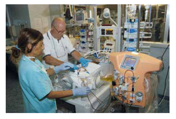
Fig. 4 - First CRRT treatment with CARPEDIEM (Cardio renal Pediatric Dialysis Emergency Machine).

nological advances in machine design, to the expanded application of novel and complex modalities and, finally, to the optimization of extracorporeal therapies in the ICU, ultimately leading to improved patient outcomes.