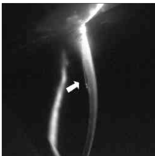
Fig. 1. A small Descemet's membrane detachment in the superonasal area.

postoperative day one, his corrected visual acuity was 20/200, and his intraocular pressure was 16 mmHg. The patient's cornea was edematous with Descemet's folds. The anterior chamber was deep with cells 4+. He was instructed to use ofloxacin eye drops and 0.12% prednisolone eye drops every two hours for one week, and then four times a day thereafter. The cornea was still edematous when he visited our clinic one week later. Three weeks after surgery, his visual acuity was 20/100 and his intraocular pressure was 19 mmHg. The patient complained of a foreign body sensation and visual disturbances. The corneal edema had improved but the slit lamp exam revealed DMD at the superonasal area (Fig. 1). There was no direct trauma to the superonasal cornea during the surgery. Because the size of the DMD was small and the location was peripheral, we decided to observe the patient for a follow-up period without surgical intervention. Postoperative use of ofloxacin eye drops and 0.12% prednisolone eye drops was maintained four times a day. During the follow-up period, an intracameral air injection was not needed because the size of the DMD decreased and the patient's vision improved. Two months after the surgery, the DMD had completely reattached and the patient's corrected visual acuity had improved to 20/30. Ofloxacin eye drops and 0.12% prednisolone drops were maintained for two more weeks. Three months later, the cornea was clear, and his