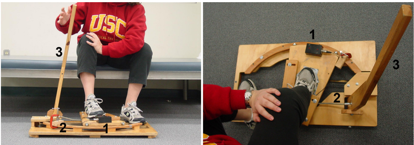
Figure 2 Exercise unit for isolated tibialis posterior exercise. (1) LED displaying static plantar flexion from pressure sensors under fore-foot; (2) Constant force extension spring for dynamic adduction; (3) Lever to allow passive adduction or abduction of the foot.

will be instructed in performing calf stretches as described earlier. A series of six, 30-second stretches on the involved