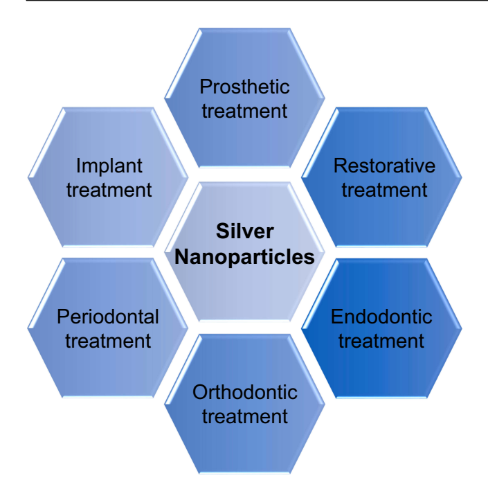
Figure 2 The antibacterial application of silver nanoparticles in dentistry.

silver nanoparticles has also displayed antifungal properties against the adhesion of Candida albicans , which is one of the key opportunistic pathogens on a denture base.<sup>22</sup>