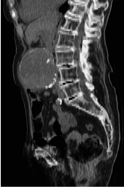
Figure 1: CT Aortogram demonstrating 8-cm infrarenal aneurysm.