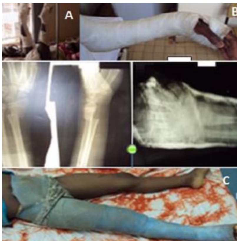
Figure 1: Different type of non-operative treatment; gallow traction on a locally made support, a BAB plaster and a single-leg spica cast (from top to bottom)