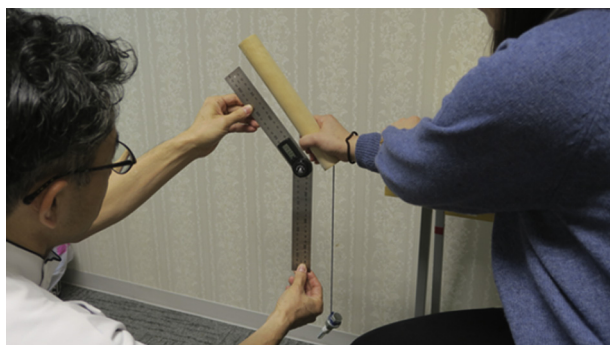
Figure 3. Goniometer placement. The stationary arm of goniometer was aligned with the string and the movable arm was aligned with the long axis of the tool.

upward and downward motions beyond the horizontal plane were expressed as the positive angle for radial extension and ulnar flexion and were expressed as the negative angle when motion did not proceed beyond the horizontal plane. The sum of angles of radial extension and ulnar flexion was defined as the range of DTM (Fig. 4). The examiners were allowed to reduce the pendulum motion of the string manually during the measurement to save time.