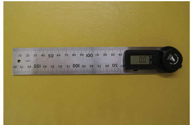
Figure 2. Digital goniometer.

intra-rater and interrater reliability were good, the device was cumbersome compared with the conventional goniometer and impractical for clinical use. In 2013, Bugden 9 proposed a method using a conventional manual goniometer to measure DTM and mentioned that further research was needed to determine the reliability of the technique. Vardakastani et al 10 examined the reliability of a method for measuring the range of DTM that complied with Bugden's technique. In their report, goniometry was unable to quantify the range of DTM accurately. In our previous study, 11 which also evaluated the reliability of manual goniometry for measuring DTM, we reported that the manner of goniometer placement described by Bugden might be a cause of poor reliability, and that the setting for goniometer placement might have to be reviewed in future studies.