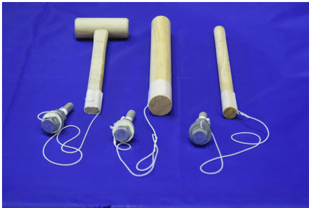
Figure 1. Experimental tools.