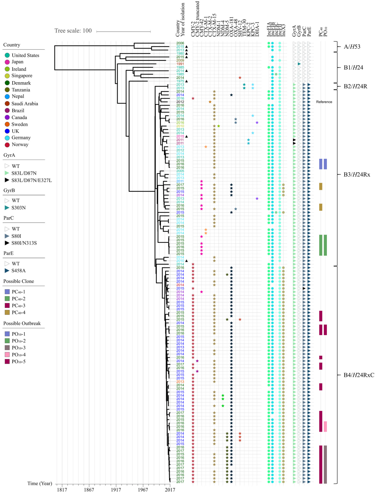
FIG 3 Time-scaled phylogeny of E. coli ST410 ( n = 127 ) with associated third-generation cephalosporin resistance; plasmid replicons; mutations in the QRDR of gyrA , gyrB , parC , and parE ; and the possible Danish outbreaks as colored by key. Brackets at right represent ST410 clades as described in the text. The tips of the tree to the left represent the year of isolation for the isolates, with the year stated next to the tips, which is colored by country of isolation, as per the key. ▲, genomes isolated from sources other than human. WT, wild type.