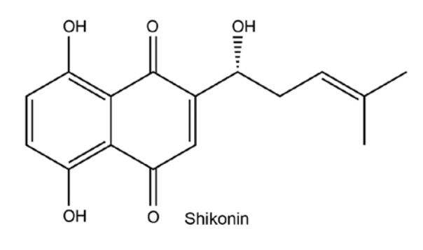
Figure 2. Chemical structure of shikonin.

Thus, PKM2 should be considered a therapeutic target in GEM-resistant pancreatic cancer cells (70,71). The role of PKM2 in GEM resistance is demonstrated in Fig. 3. Kim et al (72) discovered that PKM2-knockdown induced tumor protein 53 activation via the p38 mitogen-activated protein kinase signaling pathway, following treatment with GEM. Subsequent apoptosis was then induced through the activation of caspase 3/7 and poly ADP-ribose polymerase cleavage. These findings further indicate PKM2 as a novel target for the treatment of GEM resistance, and also support the combination of GEM with a PKM2 inhibitor for treating pancreatic cancer.