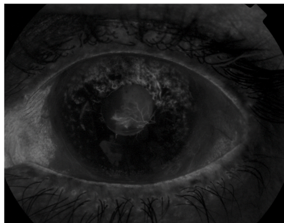
Fig. 2. Intravenous fluorescein angiography of neovascular vessels. Visualization of neovascularization of posterior capsule and iris in inferior-temporal area of left eye.

well, and peripheral PRP was completed followed by injection of intravitreal vancomycin (1mg), cefazidime (2mg), dexamethasone (400 mg), and bevacizumab (1.25mg). The rest of the procedure was completed without intraoperative complications. The patient was put on topical Tobradex QID (Novartis Pharmaceuticals) for one month and healed without complications. Culture of the aspirated vitreous and entire large pupillary vascular capsular membrane was negative for organism growth.