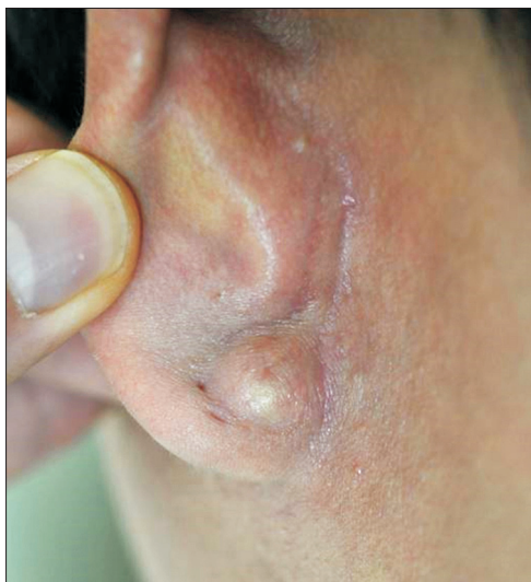
Fig. 4. Epidermal cyst in ear lobe of 28-year-old man.