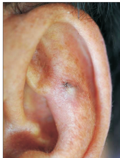
Fig. 3. Squamous cell carcinoma in antihelix of 68-year-old man.