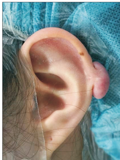
Fig. 5. Keloid in helix of 23-year-old woman.

4). Epidermal cysts are the most common cutaneous cysts and commonly occur in young to middle-aged adults. 9) The second most common benign tumors in the external ear were keloids (Fig. 5). These lesions are common after ear piercing, drainage of the ear canal, and treatment of other ear trauma. 10) This is due to the high tendency of the younger generation to use accessories such as earrings and piercings. Therefore, in our study, unlike other age groups, the earlobe was the most common site of occurrence among subjects 20–39 years of age.