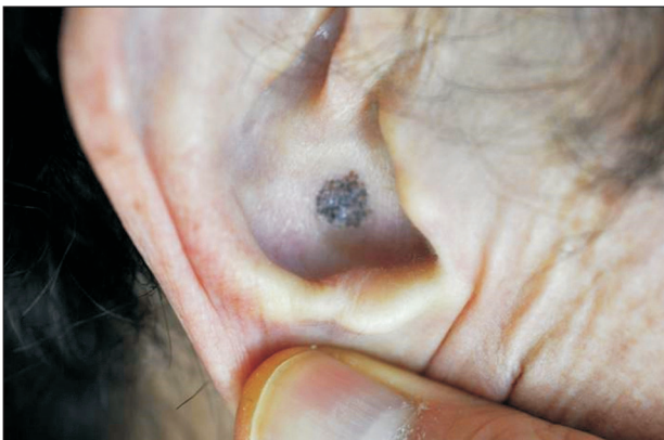
Fig. 2. Basal cell carcinoma in concha of 74-year-old woman.

Benign tumors were the most common disease in all age groups, but the prevalence was relatively low in older adults. This may be because older adults are more interested in malignant and premalignant diseases and younger people are more likely to physically stimulate the external ear. Among benign tumors, epidermal cysts were frequently found in the postauricular area and ear lobe (Fig.