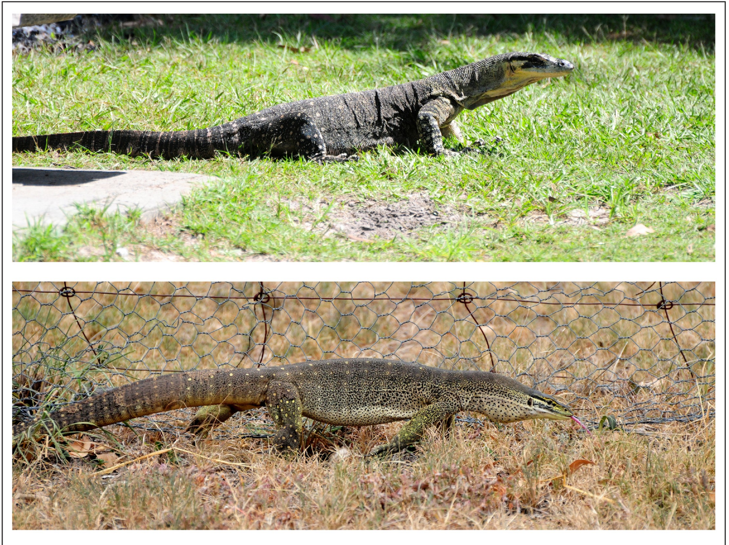
Fig 1. Lace monitor ( Varanus varius , top panel) and yellow-spotted monitor ( V. panoptes , bottom panel). Both species are large apex predators with generalist diets.

https://doi.org/10.1371/journal.pone.0254032.g001