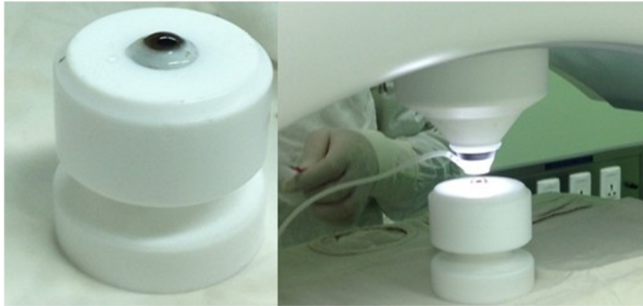
Figure 2 The eyeball fixation (left). The femtosecond laser was used to cut the donor cornea (right).