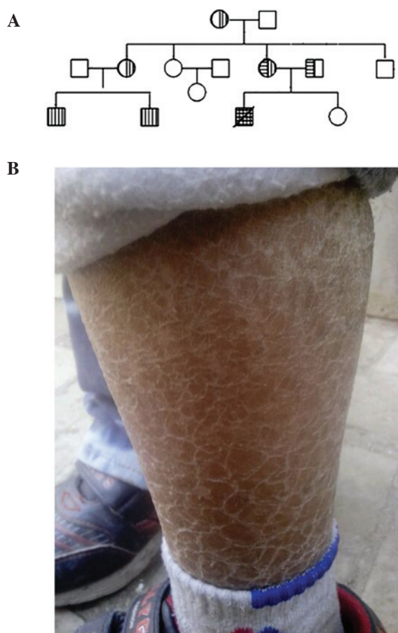
Figure 1. (A) Pedigree analysis of CN-I and XLI. White square, normal male; white circle, normal female; circle right filled with vertical lines, female carrier with XLI; square filled with vertical lines: male patient with XLI; circle left filled with horizontal lines and right filled with vertical lines: female carrier with CN-I and XLI; square left filled with horizontal lines: male carrier with CN-I; square filled with vertical lines and horizontal lines: the male proband with XLI; diagonal line, death. (B) Rhombus-shaped brown pigmentation on the lower limbs of the patient's cousin with XLI. CN-I, Crigler-Najjar syndrome; XLI, X-linked ichthyosis.

Deletion range detection. SNP array results are shown in Fig. 3. Two CNVs were confirmed for this patient: One maternal microdeletion was located on ChrXp22.31 with an estimated size of 1.61 Mb; the other maternal microdeletion was found on Chr2q37.1 (Table I), with an estimated size of 374-kb (Fig. 3A and B). Moreover, SNP array results showed that his mother had the same microdeletion of 374 kb on Chr2q37.1, but a larger deletion (~1.67 Mb) on ChrXp22.31, including STS and additional five genes (for example, mental retardation related gene VCX3A ) (Fig. 3C and D). Thus, these data suggested that the two CNVs in the patient may be inherited from his mother. One CNV contained an XLI-causing gene, STS , and the other CNV comprised a causative gene for CN-I, UGT1A1 . These genetic abnormalities were well matched to the main clinical phenotypes of the patient, i.e., ichthyosis and icterus (Table I).