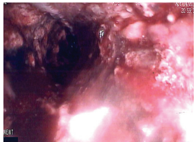
Figure 1 Initial gastroscopy showing diffuse abnormality with areas of active bleeding

Received 5 June 2012; accepted 8 July 2012