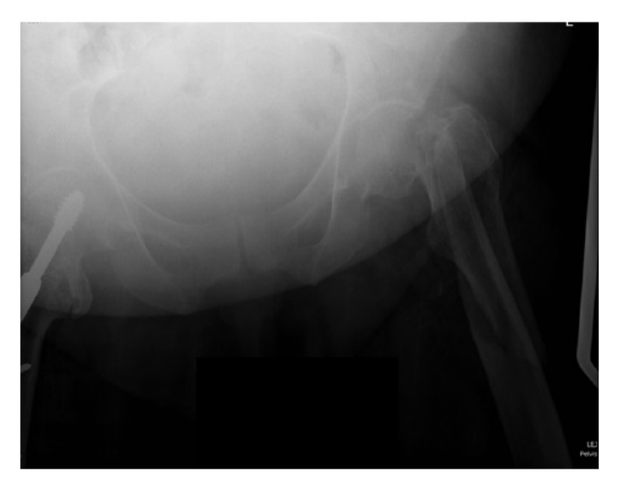
Fig. (3a). Anterio-posterior pelvic radiograph of Case 3 following the fall (a).

Case 3: Our third case was an 80 year old nursing home resident with multiple co-morbidities who mobilized with a Zimmer frame. She had a fall and radiographs revealed an intracapsular fracture with concominant subtrochanteric fracture with diaphyseal extension (Fig. 3a). She had an American Society of Anaesthesiologists (ASA) grade of 3. Various surgical treatments were considered, and to reduce the chances of any revision surgery from failure of fixation, an arthroplasty was performed. A primary femoral stem was not appropriate in view of the fracture configuration and extension, therefore an uncemented modular, taper-fluted titanium stem with a bipolar head was used (Fig. 3b). There were no recorded complications. At final follow-up at two years post-operatively, the patient remained mobile with a Zimmer frame.