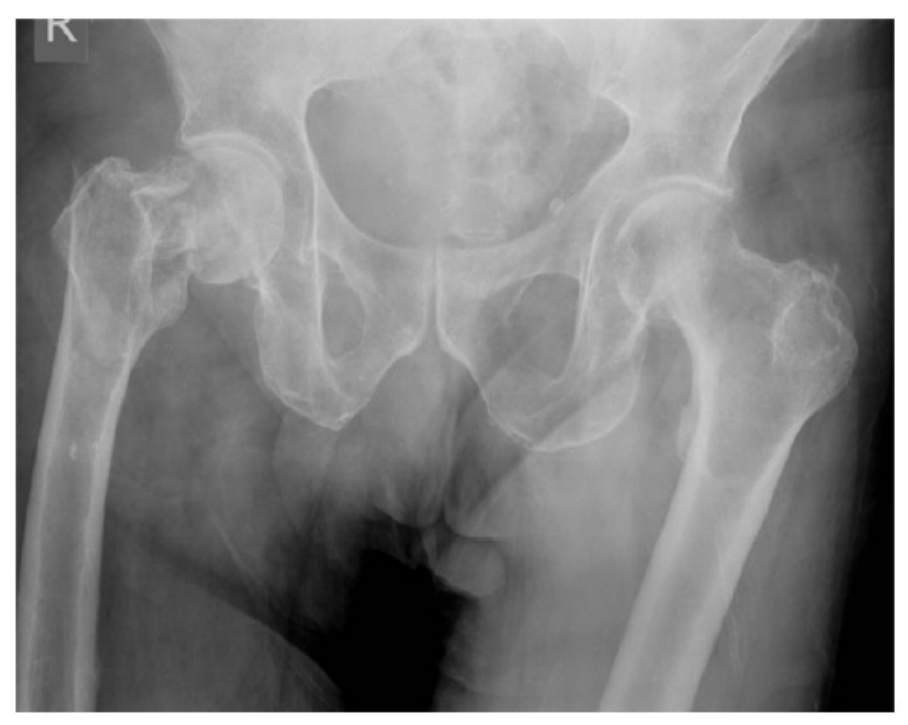
Fig. (1a). Anterio-posterior pelvic radiograph of Case 1 following the fall (a).

The complicating factors were the patient's cognitive impairment and abductor insufficiency secondary to the trochanteric fracture. To address these factors, the patient underwent a complex primary total hip replacement with a constrained liner and trochanteric grip plate (Fig. 1b). At final follow-up at 18 months he was pleased with the results of surgery and his radiographs were satisfactory. There were no recorded complications. He was mobilising unaided and still managing to go to the shops.