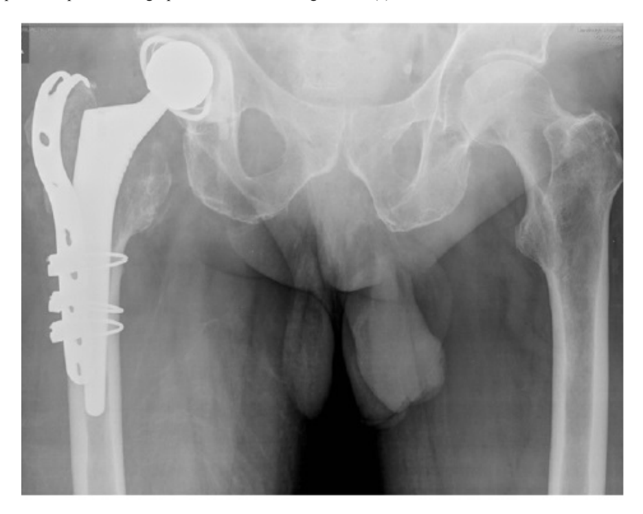
Fig. (1b). and after total hip replacement and insertion of trochanteric grip plate (b).