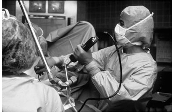
Figure 1. Camran Nezhat, MD, performs endoscopic surgery off the monitor.

Operating directly from the visual field utilizing only the monitor transformed the operating room from a "one man band" into an "orchestra," so that assisting surgeons,