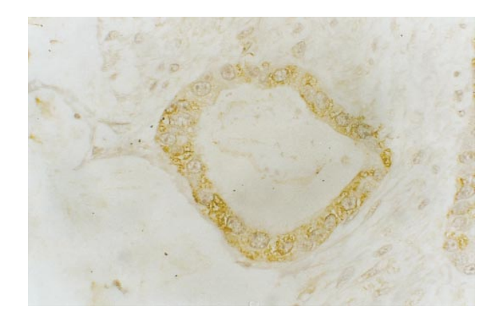
Figure 3 Immunohistochemistry. Expression of TGF-β1 in gastric cancer cells was detected by immunohistochemical analysis. Gastric cancers of the intestinal type exhibited strong TGF-β1 immunoreactivity. Magnification: 400×

Table 2 Statistical analysis of TGF- \beta 1 expression in gastric biopsies of patients with gastric cancer and first-degree relatives versus normal controls