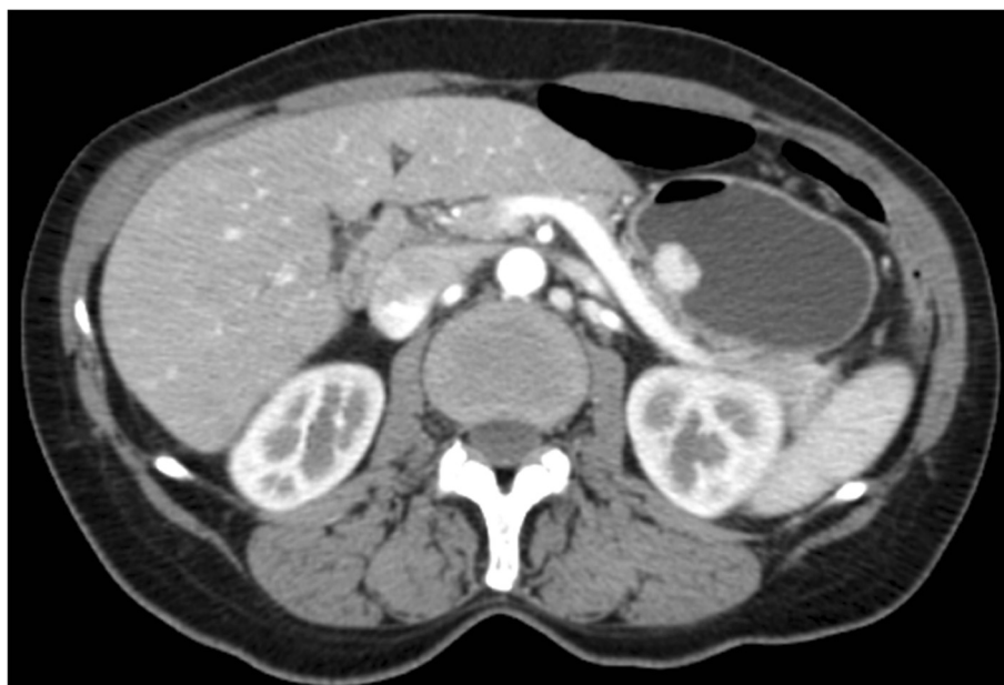
Figure 2 Abdomen computed tomography scan showed a gastric polyp with arterial enhancement and an apical area of necrosis.

neoplastic tissue in the corpus of her stomach. Thiazine staining for H. pylori was negative. Total body computed tomography showed no evidence of lymph node or hepatic metastases and confirmed a hypervascular 1.7 \times 1.3 cm polyp in the stomach (Figure 2). The patient underwent a gastric tangential resection, restricted to the portion of corpus of gastric wall involved by tumor and sparing almost all of the stomach (Figure 3). Microscopic examination confirmed a well-differentiated, low-grade, neuroendocrine tumor of the stomach infiltrating the submucosal layer with microvascular invasion. The margin of the resection was free of disease. Postoperative staging was pT1 according to the Union for International Cancer Control's TNM Classification of Malignant Tumours (7th edition). The patient's postoperative course