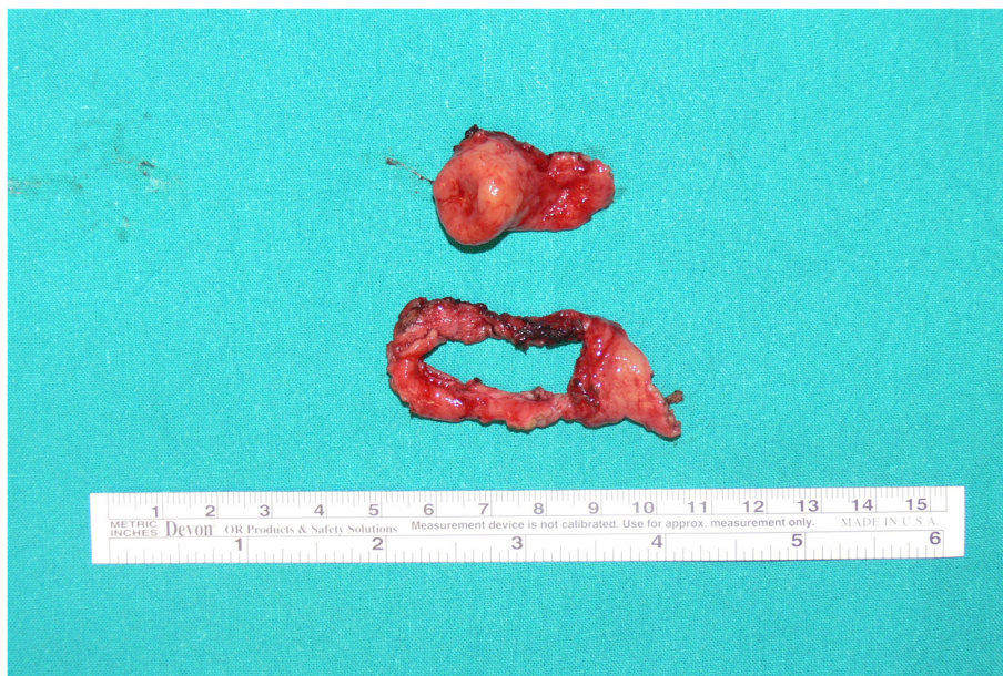
Figure 3 A gross photograph of the gastrectomy specimen showed a polyp (two cm in diameter) with an apical area of necrosis and the resected mucosal ring.

was uneventful and she remained in a good clinical condition. Six months later, her serum gastrin was 2011 pg/mL. A total body computed tomography scan and an upper gastrointestinal endoscopy excluded recurrence of the disease. A gastric antral biopsy showed mild chronic atrophic gastritis and intestinal metaplasia. Staining for H. pylori was negative. Immunohistochemical staining for cytokeratin and synaptophysin showed mild hyperplasia of neuroendocrine gastric cells. No tumor recurrence was revealed.