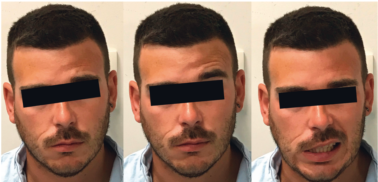
FIGURE 2: Peripheral FN palsy evaluated as HB grade 4 upon admission.

medication and reported no known allergies. This was a first accident he had in his workplace.