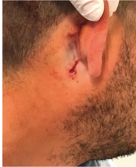
FIGURE 1: Retroauricular injury upon admission of the patient.