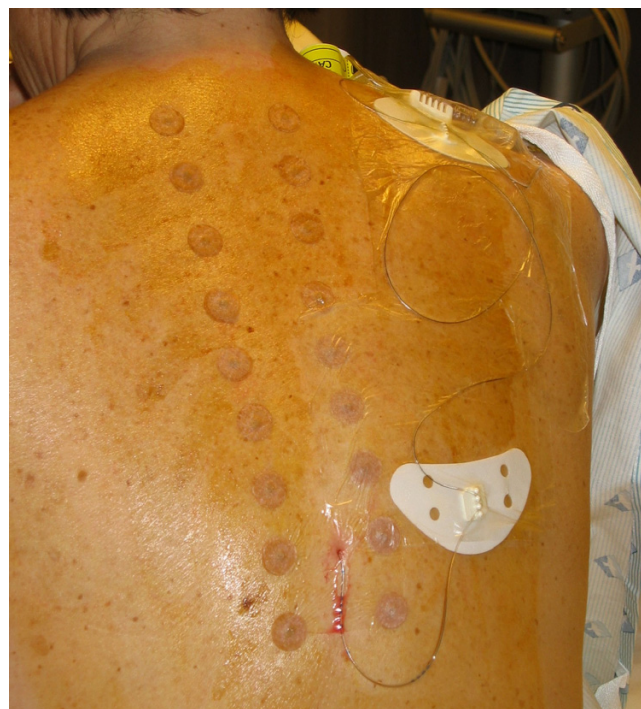
Figure 1 Intradermal acupuncture needles used in this study.

Eighteen semi-permanent intradermal acupuncture needles were inserted at points "BL12" to "BL19" and extra point Wei Guan Xia Shu. These points are approximately 2.5 cm lateral to the lower border of spinous process of the T2 - 10 vertebrae immediately after placement of the epidural catheter (see Figure 1). Subsequently, both the epidural catheter and acupuncture needles were covered simultaneously by an occlusive Tegaderm™ dressing. In addition, one needle was placed in each leg at the "ST36"