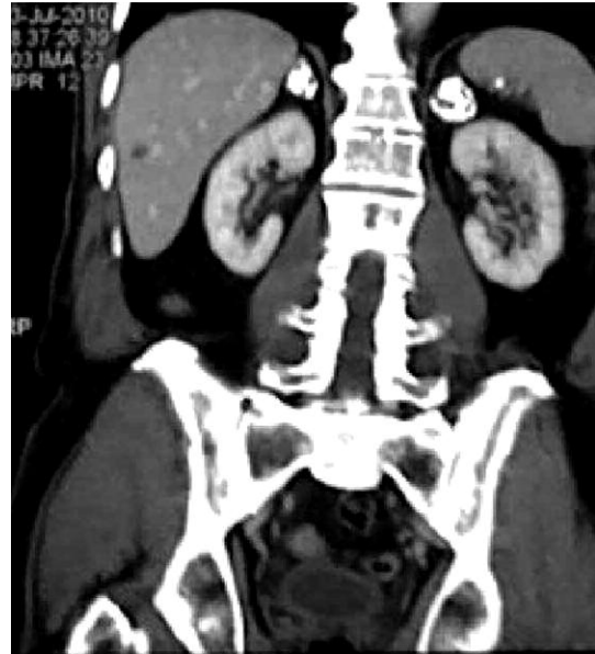
Figure 1. Computed tomography scan

Addison's disease can be due to autoimmune disorders [5-7]: adrenal insufficiency occurs when at least 90% of the adrenal cortex has been destroyed. As a result, often both cortisol and aldosterone are lacking. Sometimes only the adrenal glands are affected; sometimes other endocrine glands are affected as well, as in poly-endocrine deficiency syndrome. Suspecting an autoimmune disorder [8], we wanted to search for auto-antibodies directed against adrenal glands, but we could not perform that test because our laboratory was not equipped for that kind of examination. However, suspecting a poly-endocrine deficiency syndrome [9], given the diabetes and the primary adrenal insufficiency, we checked the status of the thyroid gland and we found hypothyroidism with a high thyroid stimulating hormone (TSH) and lower free thyroxine 4 (fT4). Anti-peroxidase auto-anti-