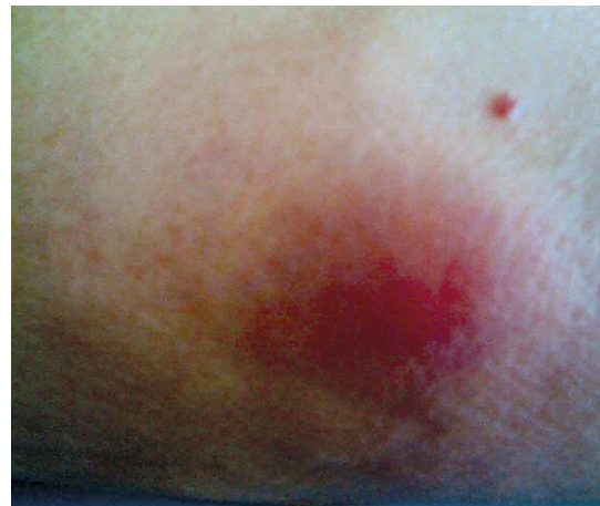
Figure 2. Tuberculin skin test