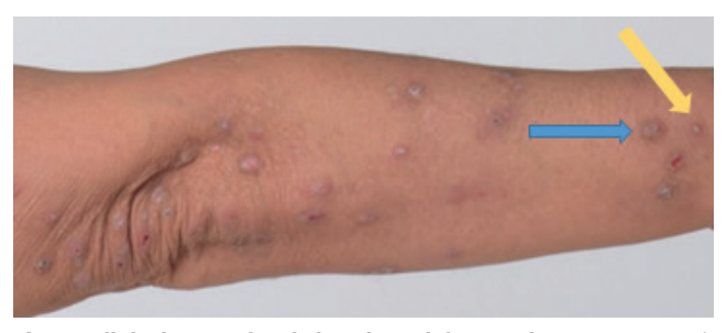
Fig. 4. Clinical example of chronic nodular prurigo. A patient with chronic nodular prurigo showing nodules (blue arrow) and papules (yellow arrow: lesions less than 1 cm in diameter).

the subjective symptoms from this objective approach and suggest continuing to use specific itch intensity scales, such as the numerical rating scale (NRS), to make an assessment of the course of itch. CPG can be clinically characterized by multiple parameters, such as the type of lesions (papules, nodules, plaques), their individual size, individual quantity on a patient, elevation, distribution, stage of healing (resolution), and signs of scratch activity (excoriations/crusts). Previous studies (7, 8, 13) have shown that the estimated or total counted number of lesions is a representative marker for CPG disease severity and thus can serve as a reliable monitoring instrument. Other approaches, such as measuring the size (longitudinal or height) of individual pruriginous lesions, did not perform well in previous studies, and thus do not constitute representative items for an IGA (7, 8, 13, 14). For development of the IGA, we used a categorization and wording internationally accepted for the assessment of inflammatory dermatoses (15, 16). CPG is a relatively rare disease and patients are mostly treated in specialized centres (17, 18). Thus, it was decided to use the estimated number of lesions in order to describe the stage. This serves as a directory for non-experienced dermatologists to select the proper stage, which is especially essential