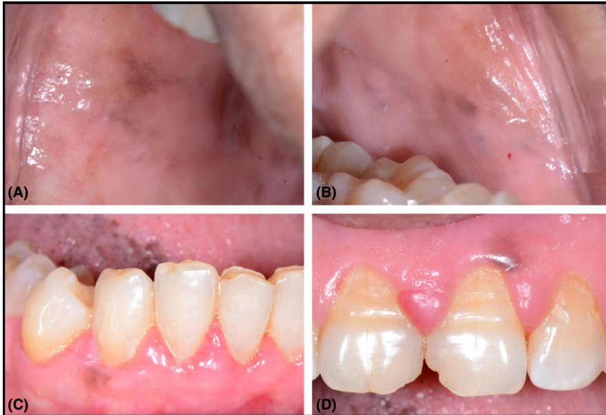
FIGURE 3 Intraoral hyperpigmentation: (A) right buccal mucosa; (B) left buccal mucosal (C) at the site of mandibular right canine; (D) at the site of maxillary left central incisor