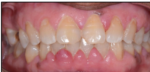
FIGURE 5 Gingival enlargement

combined with HU. However, the exact duration of use and dosage of both drugs were not determined in the study. 14