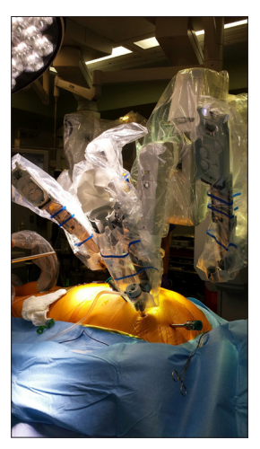
Figure 4: da Vinci surgical robotic arms, which provide 7° of movement with a motion similar to the human wrist, but with even greater precision, dexterity, and nonexistent tremors