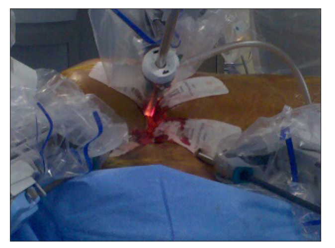
Figure 3: Photograph of the 8 mm ports on patient's thorax used for insertion of the surgical instruments

Figure 1: The da Vinci Surgical dual console can be used for both training and collaboration (Intuitive Surgical, Sunnyvale, CA, USA)