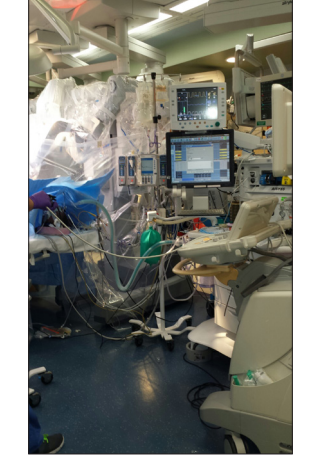
Figure 5: Crowded anesthesia workspace with anesthesia machine, monitors, and transesophageal echocardiography machine

reduced trauma that enable a faster return to baseline and improved quality of life. Despite the potential