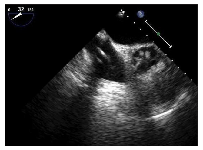
Figure 8: Transesophageal echocardiography image showing pulmonary artery vent passing from the right atrium into the pulmonary artery