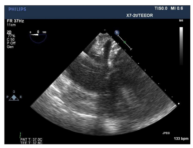
Figure 9: Visualization of the coronary sinus is critical for safe passage and positioning of retrograde coronary sinus catheter. Transesophageal echocardiography is the most commonly used modality, however fluoroscopy can also be used effectively

advantages, cardiac surgeons have been slow to abandon the median sternotomy and fully adopt robotic heart surgical techniques. A clear benefit to the robotic approach over other conventional methods has yet to be completely demonstrated.<sup>[57]</sup>