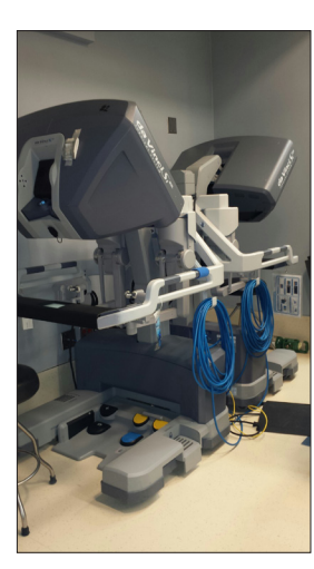
Figure 1: The da Vinci Surgical dual console can be used for both training and collaboration (Intuitive Surgical, Sunnyvale, CA, USA)