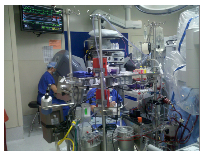
Figure 2: Operative suite showing the location of the cardiac surgeon at remote da Vinci console