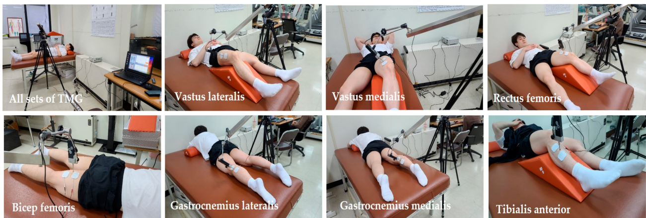
Figure 3. TMG measures' samples. TMG is a technique based on the quantification of radial muscle belly displacement in response to a single electrical stimulus. The measurements are performed in a relaxed position. A digital transducer measured the radial displacement pressed perpendicularly against the skin above the muscle belly in vastus lateralis, vastus medialis, rectus femoris, biceps femoris, gastrocnemius lateralis, gastrocnemius medialis, and tibialis anterior in both legs.