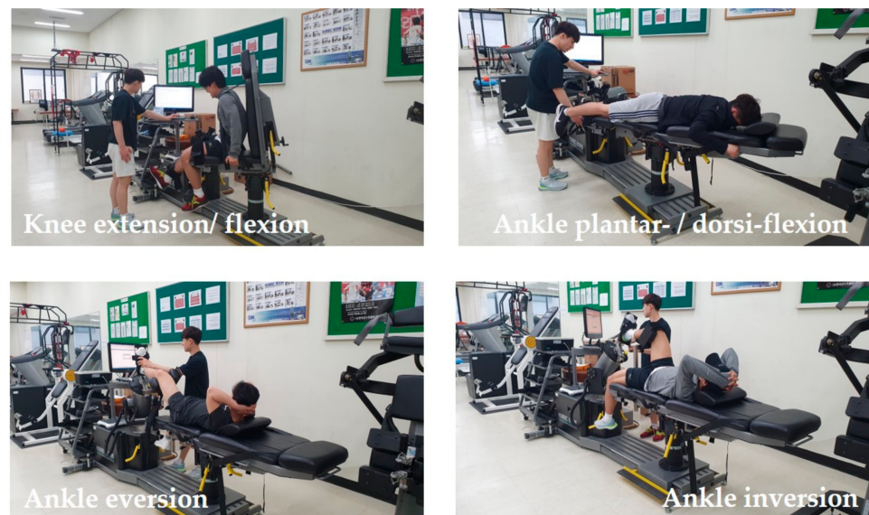
Figure 4. Isokinetic moments measures' samples. The knee joint for knee extension and flexion was positioned at 90°. All participants were concentrically tested at 60°/s and 180°/s. The test angles for ankle plantarflexion and dorsiflexion comprised of movement from 50° (plantarflexion) to 20° (dorsiflexion), where all participants were concentrically tested at 30°/s and 120°/s. The test angles for ankle inversion/eversion comprised of movement from 55° (inversion) to 40° (eversion), where all participants were concentrically tested at 60°/s and 90°/s.

All players were positioned in an isokinetic dynamometer (HUMAC ® /NORM ™ Testing and Rehabilitation System, CSMi, MA, USA) according to the manufacturer's guidelines, as shown in Figure 4. Testing was performed on the uninjured side first, and then performed on the non-injured side.