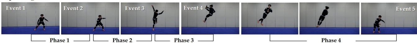
Figure 2. Events and phases in 360°, 540°, and 720° jump inside kicks. Two-dimensional images were performed to analyze the movement of jump inside at 360° ( up ), 540° ( middle ), and 720° ( bottom ). Event (E) 1, preparation stage; E2, moment of knee joint reaching the minimum angle; E3, moment of the lower leg leaving the ground; E4, moment the kicking leg reaching the highest point and making impact with a hand; E5, moment of the foot landing on the ground. Phase (P) 1, preparation segment from E1 to E2; P2, take-off segment from E2 to E3; P3, kicking action from E3 to E4; P4, turning/spinning and landing segments from E4 to E5.