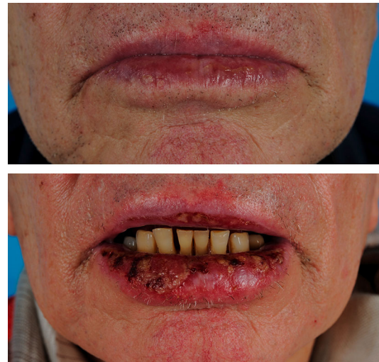
Figure 3 Severe phototoxic reaction with the swelling, blistering, erosions and crusts on the lower lip 1 week after Alacare patch photodynamic therapy.

Moderate PDT-induced pain was the major side-effect of treatment. The mean VAS score at the beginning, in the middle and at the end of treatment was 3.4 (range 1–8), 4.5 (range 1–7)