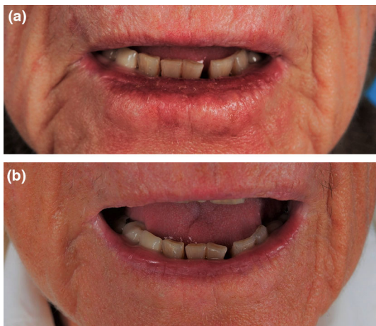
Figure 2 80-year-old lady with actinic cheilitis of the lower lip before (a) and 12 months after one single ALA patch photodynamic therapy treatment (b). Note the complete clinical cure and excellent cosmetic result.

histopathology confirmed the persistence of AC. In three further patients with a suspected relapse of AC at 6 and 9 months after PDT, respectively, histopathology was normal in two patients and positive for AC in one patient.