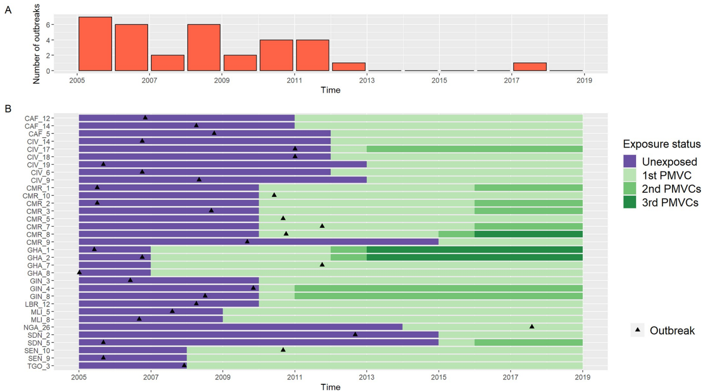
Fig 2. Swimmer plot of the chronology of exposure to preventive mass vaccination campaigns (PMVCs) and yellow fever outbreaks among the 33 African provinces both affected by an outbreak and targeted for a PMVC (2005–2018). (A) Time distribution of yellow fever outbreaks. (B) Swimmer plot. The 3-letter codes on the y-axis refer to International Organization for Standardization county codes (see S2 Table for complete province and country names).

https://doi.org/10.1371/journal.pmed.1003523.g001