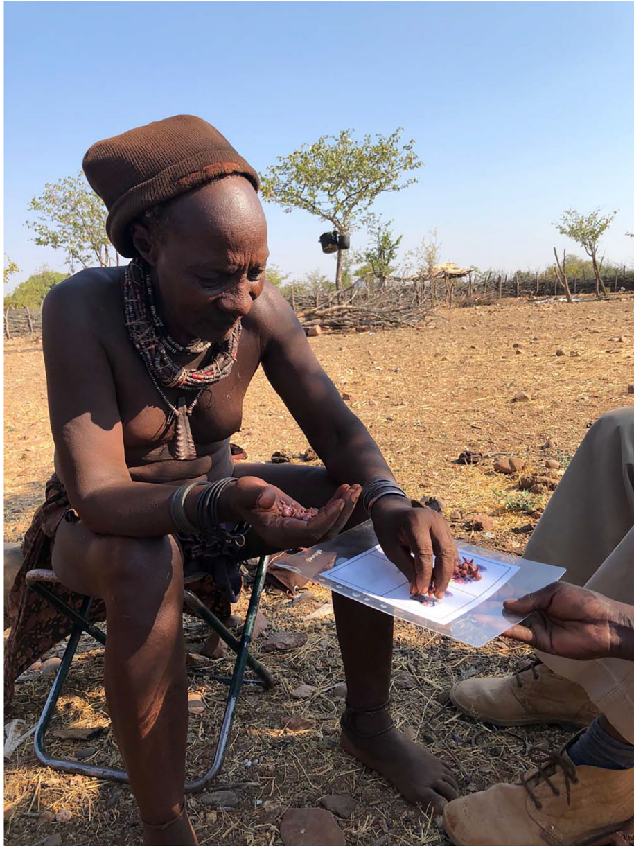
Figure 1. Himba man participating in task to assess community perceptions of the aggregate nonpaternity rate.