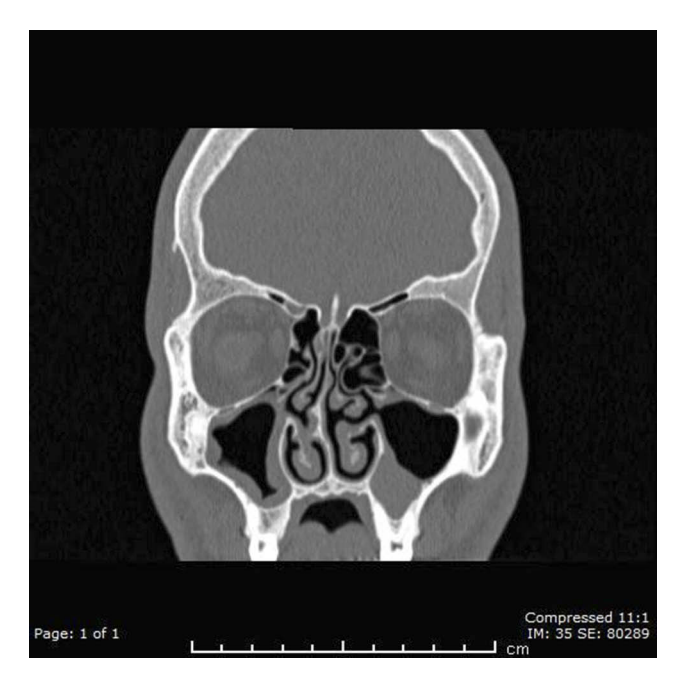
Figure 2 Paranasal CT scan demonstrated left accessory ostium with bilateral sinusitis.