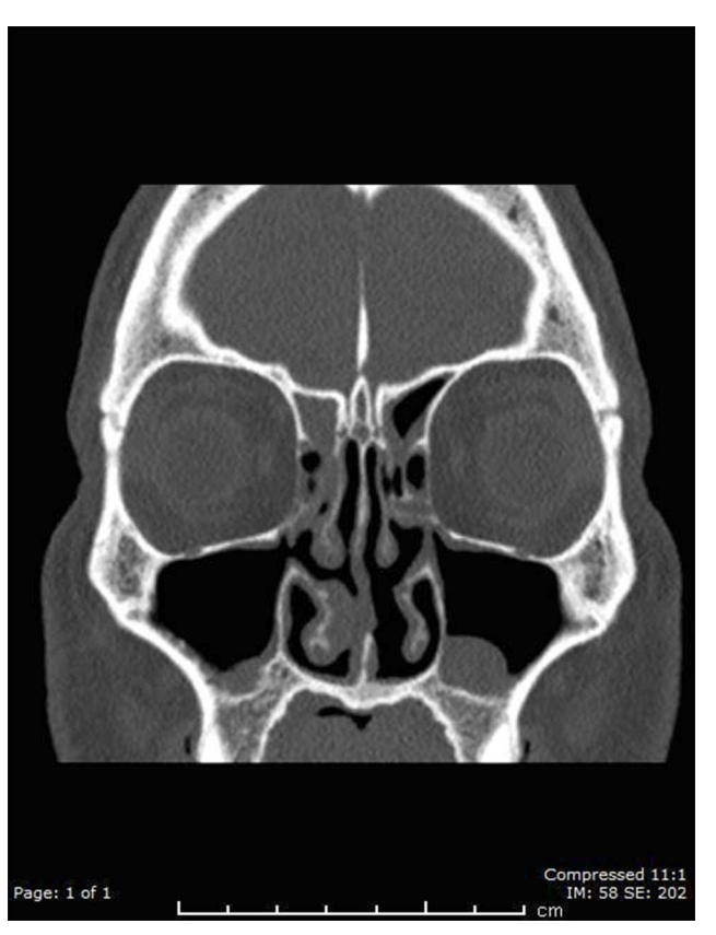
Figure 4 Paranasal CT scan showed bilateral accessory ostia and bilateral maxillary and ethmoidal sinusitis.

The prevalence of right maxillary sinusitis was significantly higher in males (P=0.002). A right accessory ostium was present in a significantly greater proportion of patients with right sinusitis compared to those without right sinusitis (33.2% vs 26.6%, P=0.018). There was no significant difference in the prevalence of right maxillary sinusitis