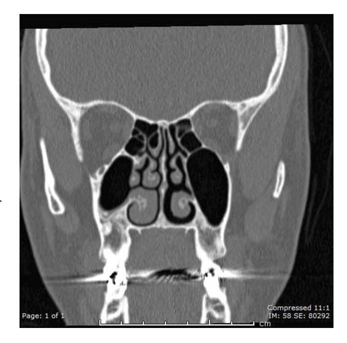
Figure I Paranasal CT scan showed the right accessory ostium.

Axial and coronal views were reviewed to evaluate the presence of accessory maxillary ostia (Figures 1 and 2), obliteration of the osteomeatal complex, and the presence of maxillary and ethmoid sinusitis (Figures 3 and 4). Maxillary and ethmoid sinus opacification graded 1 and 2 using the Lund–Mackay scoring system were considered