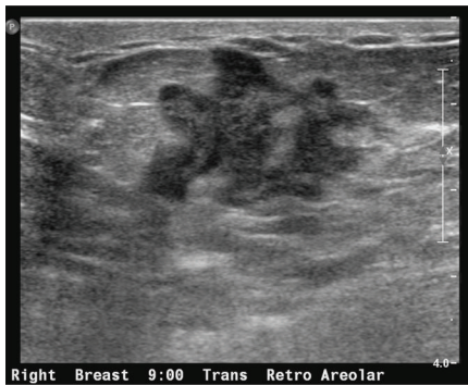
FIGURE 2: Focused ultrasound of the right breast in the retroareolar region better demonstrates the biopsy-proven invasive breast cancer.

presented with invasive carcinoma and was discovered to have coexisting DCIS in the contralateral breast.