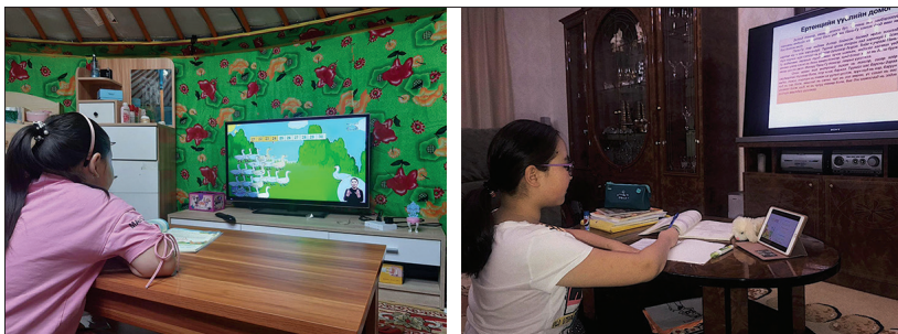
Figure 2: Schoolchildren studying through a publicly available television channel. Left: Ger household in countryside. Right: apartment household in Ulaanbaatar.

From early on, the public were engaged and kept up to date through public information provision and action, coordinated by the SEC and organised by government agencies such as the Ministry of Health. Predominantly spreading health promotion messages via public media, the SEC initiated a one-window policy to provide accessible and reliable information from only one source. 21 The one-window policy included official information and announcements communicated daily at a set time (1100 h) through all communication channels and media. The information provided included periodic and daily latest updates on self-isolation and quarantine, test results from suspected cases, general health recommendations, and the global status of the pandemic. The Ministry of Health has been issuing frequent text message alerts nationwide using all four mobile telephone carriers. The alert messages include recommendations on avoiding unnecessary domestic and international travel, self-isolation for incoming travellers, nutritional advice, and personal hygiene and protective measures.