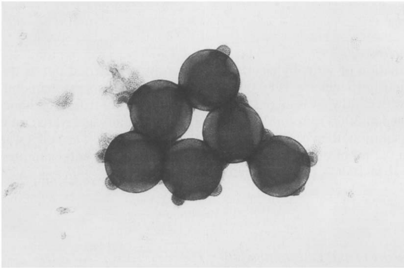
Fig. 1. Agglutination of latex particles coated with anti-OSU IgG (LA-antiOSU) with OSU ( \times 72\,000 ). LA-antiOSU was mixed with OSU for 2 min at room temperature; the mixture was stained with 3% uranyl acetate and then observed under the electron microscope.

LA-antiOSU caused agglutination with OSU within 2 min on a glass slide. To confirm that the agglutination of LA-antiOSU was really due to a specific reaction between OSU and LA-antiOSU, the agglutinated specimens were examined under the electron microscope. Rosette formation and bridge formation of the viruses on and between the LA-antiOSU particles were observed (Fig. 1). Agglutination of LA-antiOSU with OSU was completely inhibited by preincubation of OSU with anti-OSU at room temperature for 6 min (Fig. 2).