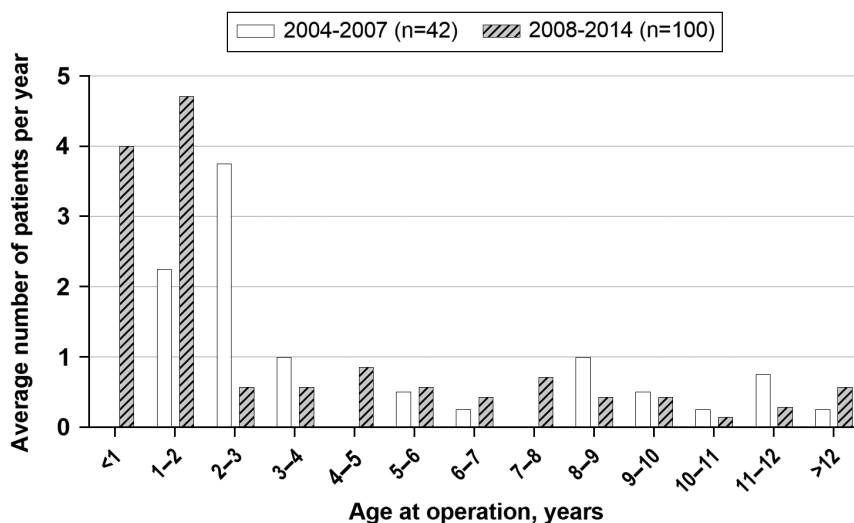
Figure 3 Age at orchiopexy. Age at bilateral orchiopexy or first of the two unilateral orchiopexies in a single tertiary center in 142 boys operated between 2004 and 2014. 42 boys were operated between 2004 and 2007 before the release of the Nordic consensus on treatment of undescended testes (8) and 100 boys thereafter.

are few. In our series, approximately half of the patients had 46,XY DSD, whereas only one-tenth (9.6%) had 46,XX DSD. The proportion of 46,XY DSD patients is similar to the results reported from Turkey (47%) (12), South Africa (57%) (13) and North India (52.5%) (17), and somewhat lower than has been reported from Indonesia (68%) (16). On the other hand, our series contained more cases with sex chromosome DSDs than the previously mentioned reports, which may reflect differences in prenatal screening policies. Of note, in a recent Danish nationwide study, the estimated prevalence of androgen insensitivity syndrome was 2.3 per 100,000 live born females (24), which appears close to our frequency estimate based on the current catchment area of our tertiary center. In our study, congenital adrenal hyperplasia (CAH) was expectedly the most common cause of 46,XX DSD. After the implementation of the newborn screening in Finland