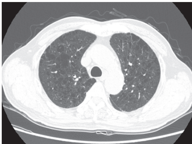
Fig. 2. High-resolution chest computed tomography before the initiation of oxaliplatin, 5-fluorouracil, and leucovorin (FOLFOX) treatment. There is underlying emphysema on both upper lungs.

disease, bronchoscopy was performed. On bronchoscopic examination, there was no endobronchial lesion, and no other infection or malignancy was shown on bronchoscopic biopsy or bronchoalveolar lavage cytology. The bronchial washing culture was also negative. At the beginning of the treatment, the patient had felt better in terms of dyspnea. However, after two days of hospitalization, the dyspnea worsened; in spite of the medical treatment, the diffuse ground-glass opacities on the chest X-ray had progressed. On the 3rd hospital day, the patient was moved into the intensive care unit (ICU) and intubated, and mechanical ventilation was started. Steroid therapy was changed to intravenous methylprednisone, but the patient showed a poor clinical course and progressively worsening radiographic findings. On the 23rd hospital day, he died due to irreversible respiratory failure and multiple organ failure.