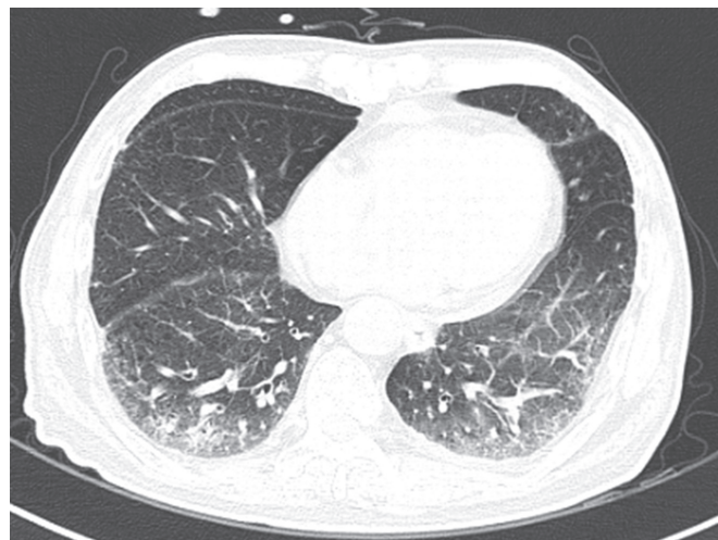
Fig. 3. High-resolution chest computed tomography. There are ground-glass areas on both lower lungs and a patchy consolidation on the right lower lung.

A 73-year-old man with hepatic flexure colon cancer was referred to the Department of Surgery for operation. He had a medical history of noninsulin-dependent diabetes mellitus without complications and no history of cigarette smoking. A right hemicolectomy was performed for colon cancer on the hepatic flexure in July 2009. Pathology showed a moderately differentiated adenocarcinoma that had infiltrated the pericolic adipose tissue. Lymphatic, perineural and venous invasions were not presented. Metastasis of a regional lymph node was found in 1 out of 34 retrieved pericolic lymph nodes. The final pathologic stage was T3N1M0, stage IIIB. A chest X-ray and chest CT before the initiation of chemotherapy showed an emphysematous lung on both upper lobes and the right middle lobe, but no pulmonary symptoms were present (Fig. 2). Adjuvant chemotherapy, including the FOLFOX-4 regimen, was started in September 2009. There were no specific changes on follow up after every three cycles of chemotherapy, including CT and