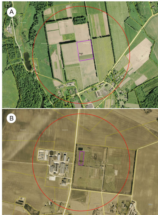
Figure 3. Maps of the strawberry fields (A) in Polli (Viljandi County, Estonia) and (B) Rõhu (Tartu County, Estonia). Strawberry fields are surrounded with purple rectangles; the dots in the fields represent the position of the hives on the field with the name of the experimental area, and the red circles delineates the 500-m area which represents the most likely foraging area of B. terrestris surrounding the hives. All the hives were equipped with two-way dispensers (BioPest), but the biocontrol Prestop-Mix preparation was used first in Polli (2012) and, subsequently, in Rõhu (2013, 2014). In 2013 and 2014 in Polli only pollination efficiency without the pathogen control was assessed. The backdrop maps are created using X-GIS(6) from Estonian Land Board mapserver.

flowers were placed on the ice immediately after collection and kept at -20^{\circ}\text{C} until their analysis. The flower collection was made on days favourable for bumble bees foraging.