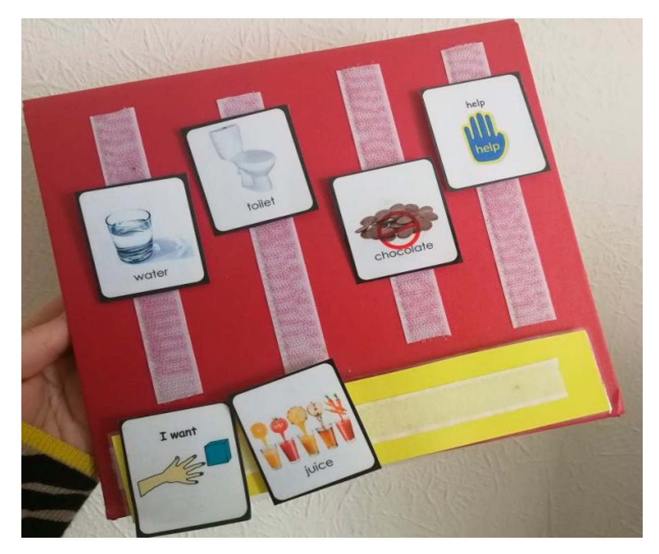
Figure 1. Communicating Differently V&A Blog (vam.ac.uk) [8].